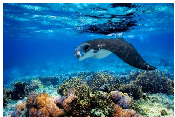
From top: Raja Ampat island, Spinner Dolphins, Manta Ray